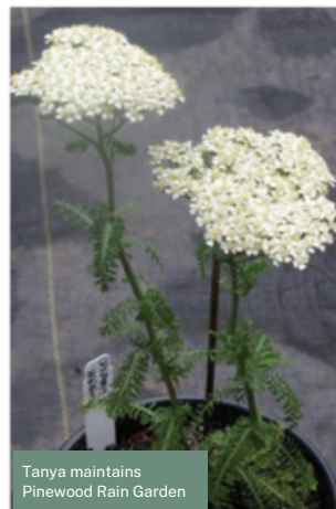
Tanya maintains Pinewood Rain Garden

“The main goal of my project was to get younger kids interacting with green spaces around them. Kids are so curious about nature. It gives me hope that we can fix the climate crisis, that we can solve this problem.”